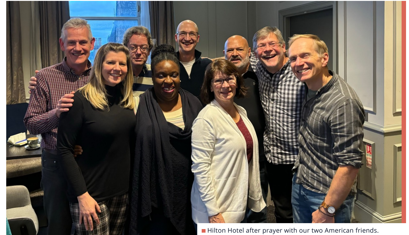
■ Hilton Hotel after prayer with our two American friends.