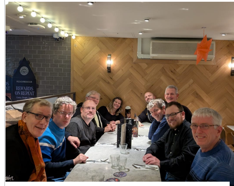
■ Team day wouldn't be the same without dinner together.

Special thanks to the Christian Medical Fellowship for their hospitality ■